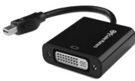
Mini DisplayPort to DVI Model 101002