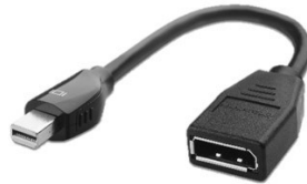
Mini DisplayPort to 4K DisplayPort Model 101004

Customer Support and Contact Information Cable Matters offers lifetime technical support as an integral part of our commitment to provide industry leading solutions.