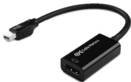
Mini DisplayPort to HDMI Model 101001

View our other Mini DisplayPort Adapter products at www.cablematters.com